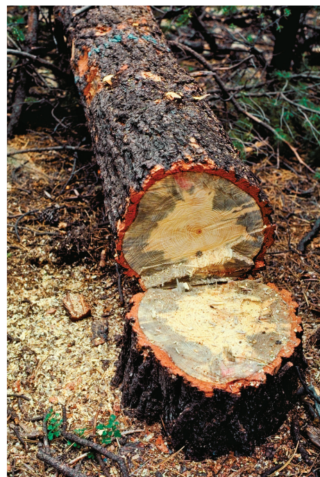
Figure 9: Cut tree killed by MPB, showing the characteristic blue-staining pattern.