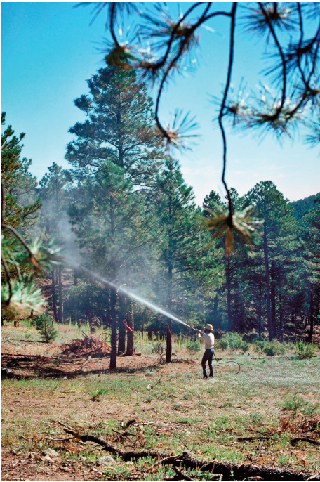
Figure 10: Large, uninfested pine being preventively sprayed. This protects high-value trees and should be done annually between April 1 and July 1.