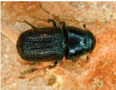
Figure 3: Top view of adult MPB (actual size, 1/8 to 1/3 inch).