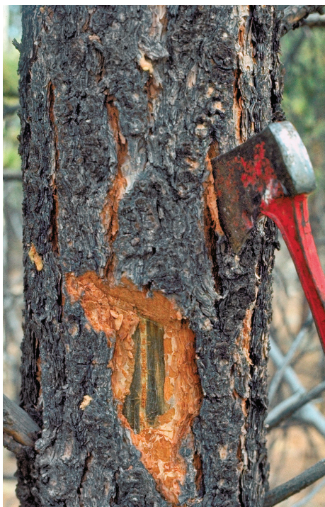
Figure 7: Checking beneath the bark for MPB. This attack was successful (note tunnels and stain).

One very effective way to kill larvae developing under the bark (though very