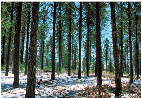
Figure 11: The appearance of a forest thinned to help prevent MPB. This can also improve mountain views and reduce fire hazard.