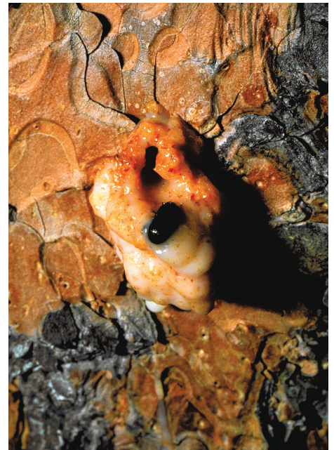
Figure 6: Not all pitch tubes indicate successful attacks. Note the beetle trapped in this large pitch tube. If the majority of tubes look like this, the tree may have survived the current year’s attack.