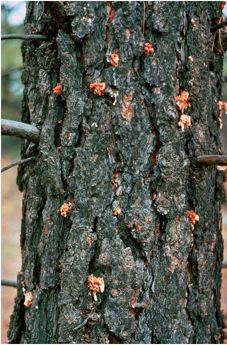
Figure 2: “Pitch tubes” indicating trunk attacks by MPB. Success of the attacks is confirmed by looking under the bark with a hatchet for beetles, their tunnels and/or bluestaining.