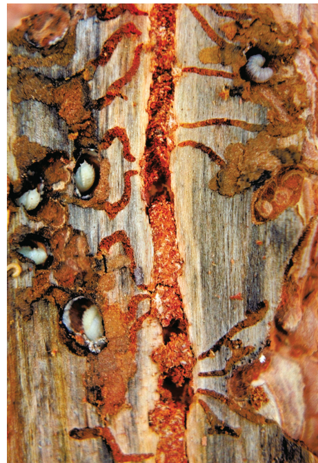
Figure 8: Characteristic tunnels (galleries) of mountain pine beetle made by the adults and larvae. The underbark area looks like this in late spring. Bluestained wood is caused by fungi the beetles introduce.