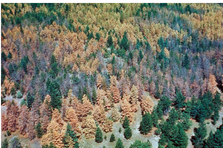
Figure 4: Mountain area infested by MPB, showing three years of mortality. Old, dead trees are gray; newly killed trees are straw yellow or orange. Some trees may also be infested but do not turn color until nine months or so under attack.